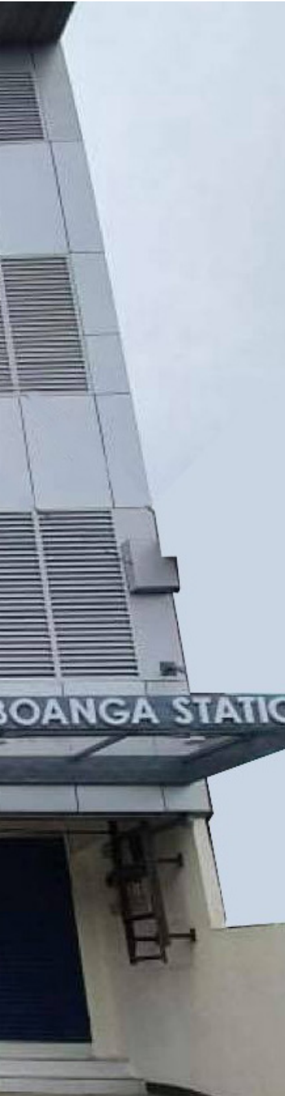
New building built in Zamboanga City

M edia giant GMA Network further strengthens its presence all over the Philippines as it launches its latest addition to its growing number of regional TV stations, GMA Zamboanga—becoming its fourth regional TV station in Mindanao and the 10th regional TV station in the country.