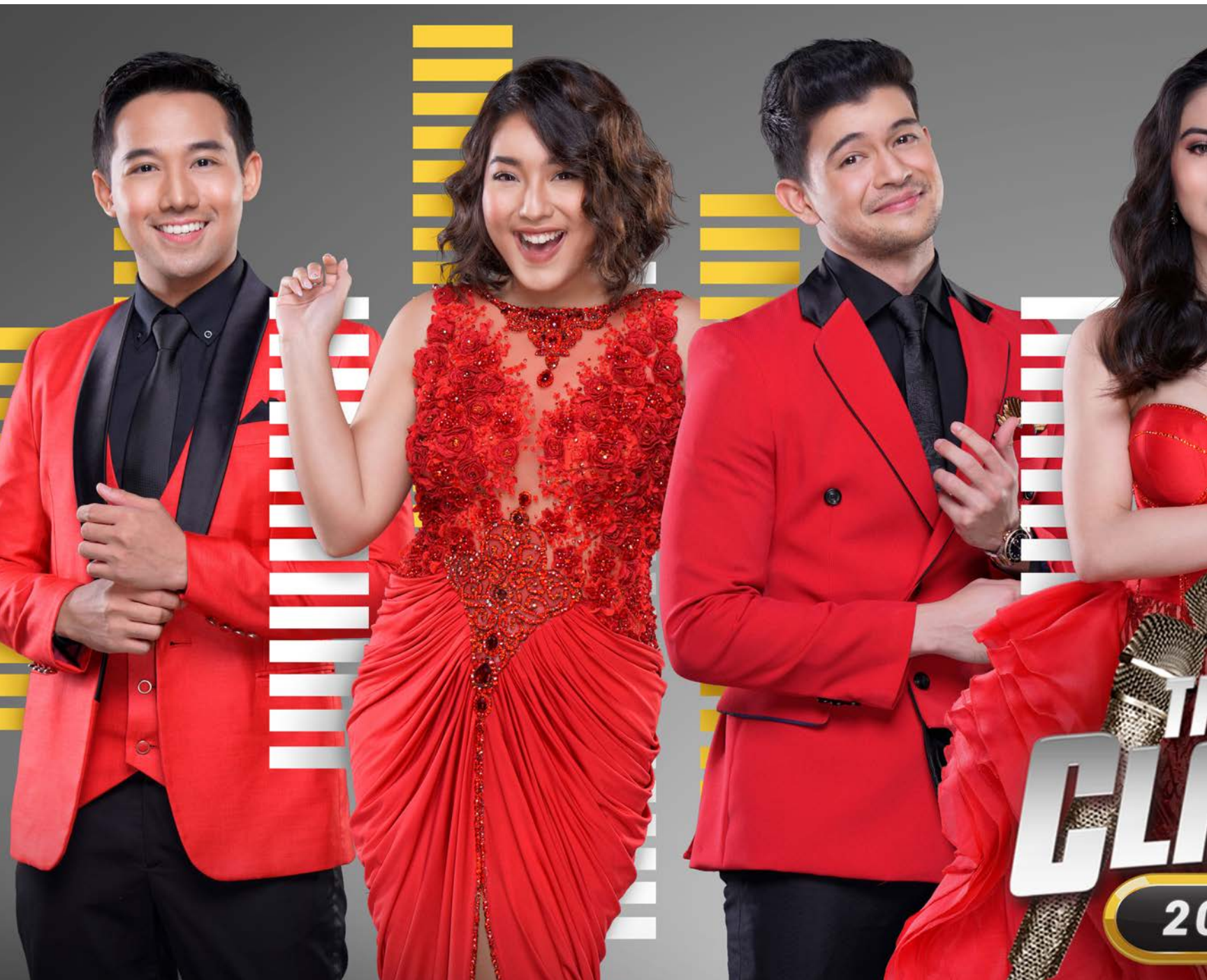
(L-R) Ken Chan, Rita Daniela, Rayver Cruz, Jule Anne San Jose, Aiai delas alas, Lani Misalucha, and Christian Bautista