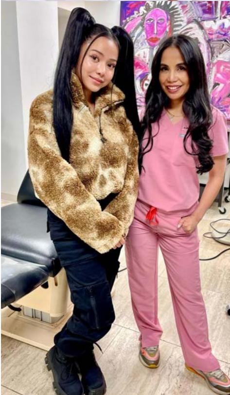
FilAm singer-influencer Bella Poarch ( with over 14M and 7.8 FB followers)